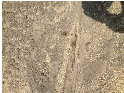
(B) Water entering at blister