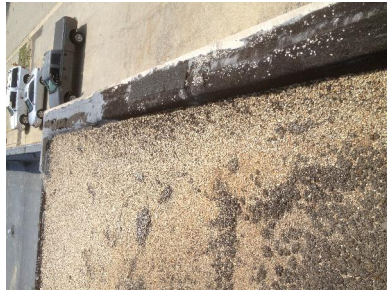
(A) Failure in wall flashing